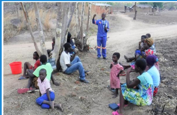
82,000+ villagers have responded to the gospel since 2008!

6 people from AMMAR MOSQUE gave their lives to the Lord!