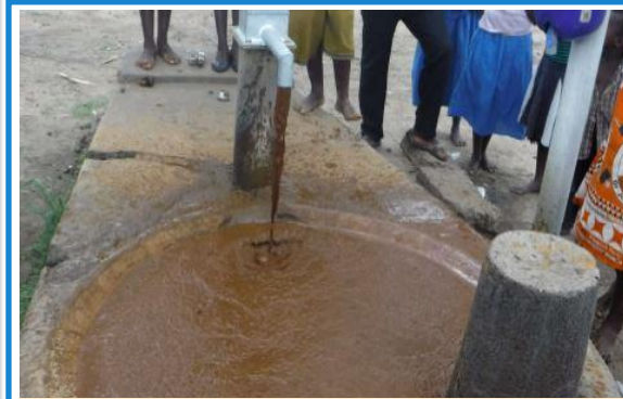
Example photo of alternate water source

Number of People Served: 202 Adults + 284 Children = 486 Villagers